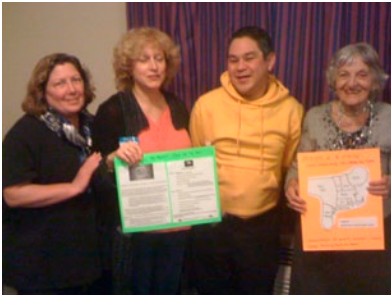
Pathways to Cosmic Consciousness Course Milford, CT