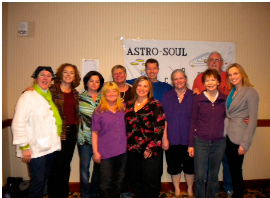
1st WCF sponsored Astro-Soul Retreat

Spirit Is Our River is a publication sponsored by Wayshowers Community Fellowship, and umbrella for all spiritual traditions.