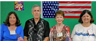
2009-2011 Executive Committee of the WCF Board of Directors

Let's get more involved with the Spirit that Unites Us!