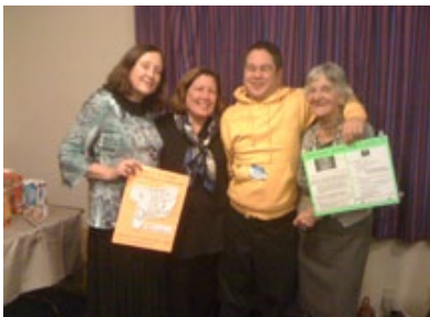
Pathways to Cosmic Consciousness Course Milford, CT

Course 560 has helped reaffirm my true purpose for this lifetime. I am a a soul with a physical body, not a physical body with a soul. I learn from my experiences and lessons in this lifetime and take it with me so that I can grow spiritually through many lifetimes. Life is a game and I need to know how to play it. Group work has opened me up to many new experiences and apprentices. I have learned to find peace in myself and others. I have gained self-confidence in everything I do. I continue to live my life's thrust. My organization and goals are clearer to me because my guides are here to back me. If I stay cleansed and mediate I am in my sea of tranquility all the time.