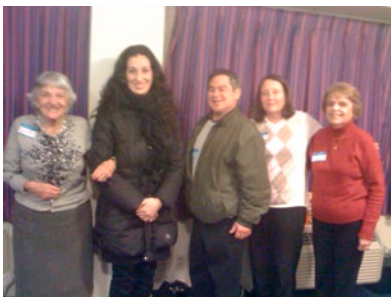
Pathways to Cosmic Consciousness Course Milford, CT